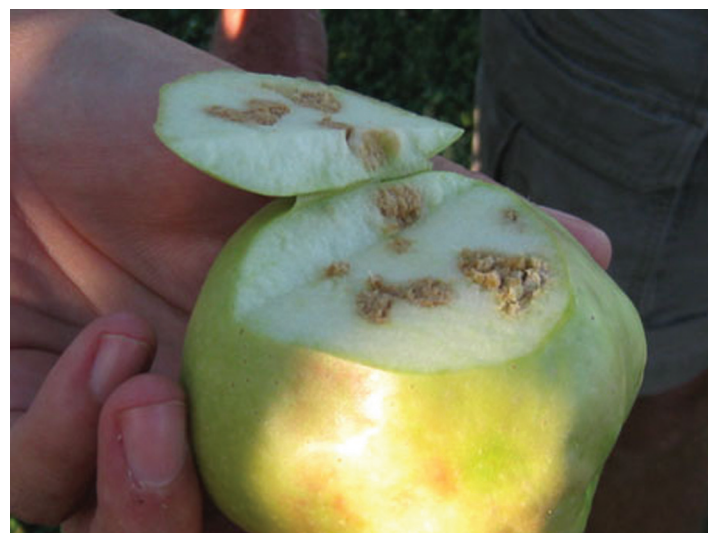
Figure 3. Internal injury to 'Pink Lady' apple as a result of BMSB feeding.

Orchard Crops. In Asia, BMSB is an outbreak pest of tree fruit (Funayama 2002). Damage to tree fruit in the USA was first detected in Allentown, PA and Pittstown, NJ (Nielsen & Hamilton 2009b). In orchards where BMSB is established, it quickly becomes the predominant stink bug species and, unlike native stink bugs, is a season-long pest (Nielsen & Hamilton 2009b, Leskey et al. 2012b). In 2008–2009, increasing BMSB populations in WV and MD caused late-season problems to fruit crops (Leskey & Hamilton 2010a). In southern PA and VA, BMSB was not a recognized pest until the 2010 season. However, injury to apple (Figure 3) was probably mistaken for physiological disorders such as cork spot and bitter pit. Severe pest pressure in 2010 resulted in $37 million in losses to mid-Atlantic apples alone (American/Western Fruit Grower 2011) with some stone fruit growers losing > 90% of their crop (Figure 4, Leskey & Hamilton 2010b). In 2011, damage, though not as severe, was observed