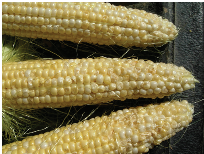
Figure 6. BMSB adult and nymphal feeding damage to sweet corn kernels.

perimeter treatments and identifying BMSB densities needed to cause delayed plant maturity, the “stay green effect” (Figure 7). Results from insecticide trials conducted in VA and MD indicate that most labeled products provide control though further information including residual activity is needed. Several wheat fields in MD were reported to contain very high BMSB adults and one field yielded egg masses. Most adults were near the field edge, adjacent to wooded borders. Research on native stink bugs indicates that the most susceptible stages of wheat development are the milk and soft dough stages (Viator et al. 1983). This coincides with the stage of the wheat fields containing large numbers of BMSB adults. Adults from those fields laid many eggs over a very short time in the laboratory. In the absence of a more highly preferred host, wheat may be susceptible to BMSB, though more studies are needed to determine if BMSB poses a significant risk. High populations (> 3 per ear) were found on corn plants after the ear had started to form especially within the first 12 meters of field margins in DE. Unlike soybeans, perimeter treatments are generally impractical for treatment of late-stage corn. A pilot investigation in MD to determine how the surrounding landscape influences densities in field corn suggests that corn fields bordered by woodlots, other crops, and buildings have higher populations compared with fields bordered by roads.