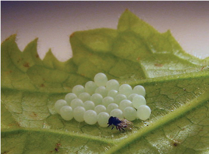
Figure 11. Adult Trissolcus female attacking eggs of BMSB.

the Working Group and available on the Northeastern IPM website has resulted in > 16,000 visits since 2010. Successful grant initiatives that have cited priorities defined by the Working Group include the USDA-NIFA Critical Issues and Northeastern and Southern Regional IPM grants. In addition, a national coordinated agricultural project funded by USDA-NIFA Specialty Crop Research Initiative is studying the biology, ecology, and management of BMSB in specialty crops. This project includes over 50 researchers from 10 states and includes a national outreach program that specifically targets growers. The Northeastern IPM Center leads this national outreach effort. A website, StopBMSB.org, (Figure 10) serves as a hub for delivering BMSB management information and providing knowledge emanating from the project's research program, links to key BMSB resources, and provides "the best of" current information with an eye toward adding value for growers. The United Soybean Board has funded a multi-state research project to develop information on impact by and management of BMSB in soybeans.