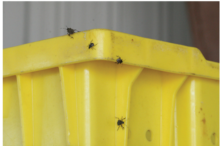
Figure 5. BMSB nymphs crawling from a container of machine-harvested blueberries highlighting the problem of contamination at harvest.

Small Fruit. Little is known about the impact of BMSB in small fruit crops. Research is underway to establish the impact of BMSB feeding, determine BMSB phenology, and to identify landscape and temporal risk factors associated with BMSB on small fruit crops. In blueberries, BMSB was first observed during the late-season in 2010, and many NJ blueberry growers have since reported it in and around structures and houses. Contamination risks are a great concern to blueberry growers who mechanically harvest and then sell to processors or ship to other countries and regions within the USA (Figure 5). During 2011, BMSB populations in NJ blueberry farms remained low and did not require control measures. In caneberries, stink bug species cause two types of injury. Although not thoroughly investigated, it appears that early