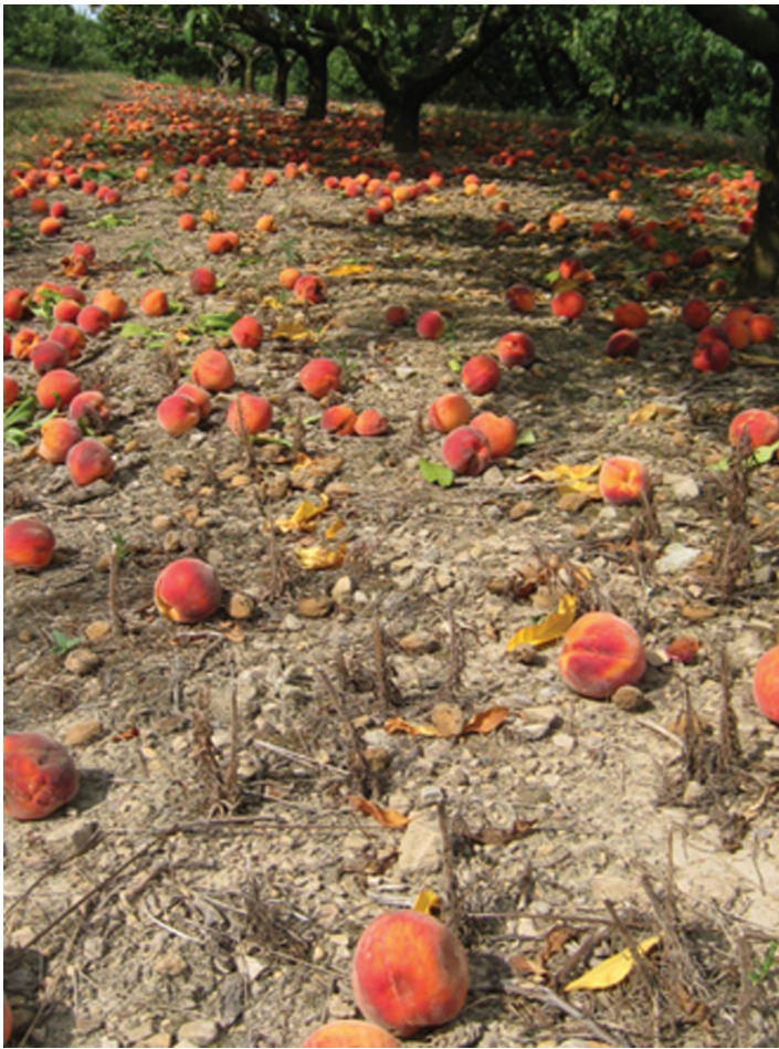
Figure 4. 'Red Haven' peaches stripped from trees by a MD grower and left to rot because of ~100% BMSB injury in July, 2010.

a wider range of grape cultivars and possible mechanisms of resistance. Management programs in grapes that do not rely on pyrethroids are needed to avoid secondary outbreaks of grape mealybug, the vector of grapevine leafroll virus. As for potential taint of wine, controlled inoculation (as many as 25 BMSB/11.3 kg fruit) of juice/mush has not resulted in perceptible taint/aroma following fermentation; chemical analysis is in progress. Effective means to remove BMSB from clusters just before harvest were established in VA, lessening the risk of tainted wine. Additionally, large numbers of BMSB adults seeking overwintering sites damage the ambiance of commercial wine tasting rooms.