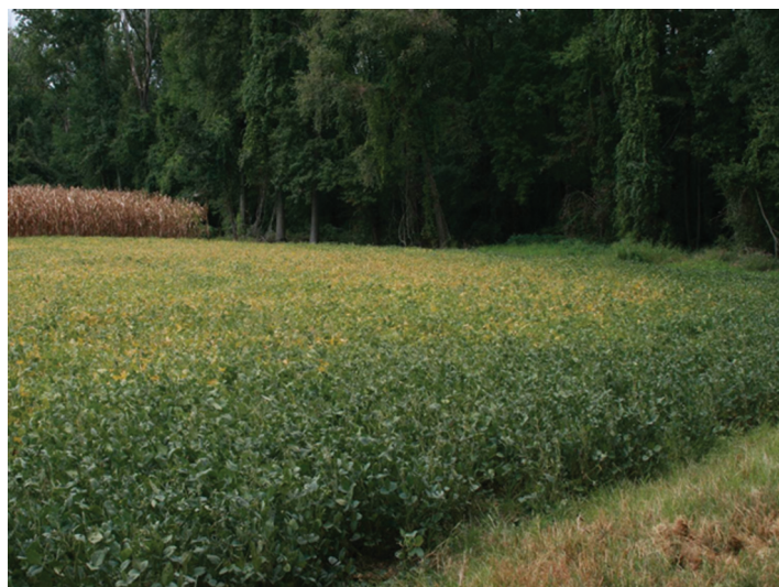
Figure 7. BMSB feeding injury to the periphery of a soybean field illustrating the “stay green” effect and contrasting with the unaffected, normally senescing plants at the center of the plot.

Ornamentals. In its native range, BMSB feeds on numerous ornamental plants (Hoebeke & Carter 2003). Ornamental crops in the USA are at risk because of the highly polyphagous nature, high mobility, and the observed direct and potential indirect damage by BMSB. Known ornamental hosts include woody and herbaceous plants in nurseries, urban landscapes, natural areas, and house plants (Raupp et al. unpubl. data ). Currently, the host list of BMSB includes > 100 plants many of which are ornamentals (USDA APHIS 2010 and references therein). BMSB became an important pest and economic threat in commercial nurseries and landscapes with the large populations of 2010. By mid-summer in MD, BMSB was feeding on fruits of crabapples, hawthorns, and serviceberries, disfiguring fruits and wilting plants. By autumn, BMSB became very abundant feeding on the trunks of several trees