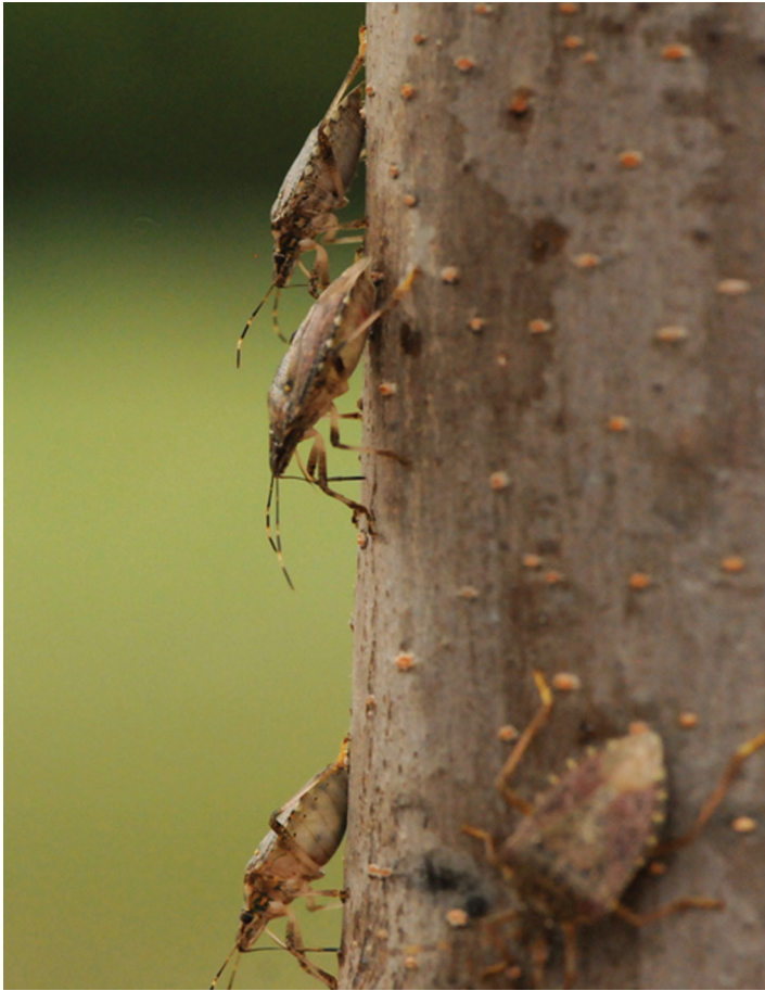
Figure 8. Adult BMSB feeding on the trunk of a London plane tree, Platanus × acerifolia .

floors with their frass, and activity due to their attraction to light and moisture especially as temperatures warm (Inkley 2012). Their nuisance impact is well-documented by an enormous volume of requests for information on the biology and management of this pest at web sites and telephone hot lines maintained by state government agencies and institutions. Since 2004, a Rutgers University web-reporting site has received 10,000 BMSB reports and Pennsylvania State University's BMSB online fact sheet has been viewed more than 600,000 times since 2008 (Jacobs, personal communication ). In 2010 and 2011, University of Maryland's BMSB web page received more than 80,000 visits, while email and phone contacts addressed approximately 900 inquiries (Traunfeld, personal communication ) and a self-help YouTube for consumers generated about 1,300 hits per month since posting in 2011. Distinct autumnal peaks of reports/visits clearly defined the annual activity pattern of BMSB as they begin to enter homes in mid-September. Additional web activity occurs in January-April.