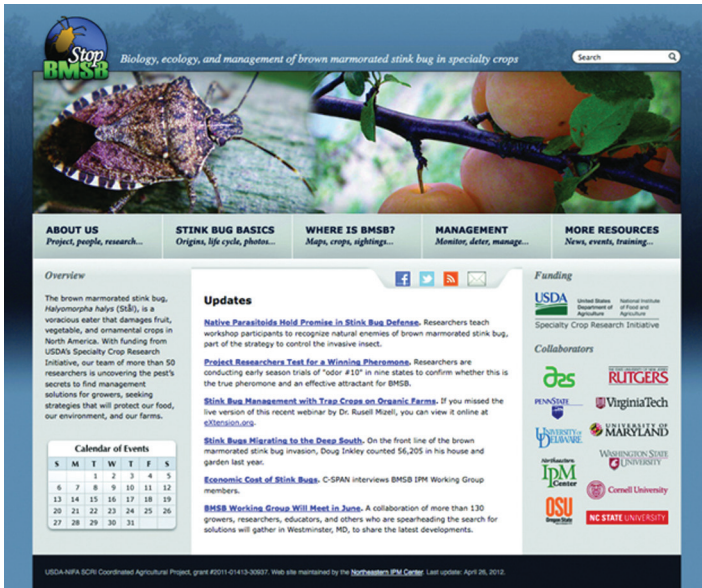
Figure 10. StopBMSB.org, the web site for the USDA-NIFA SCRI coordinated agricultural project.