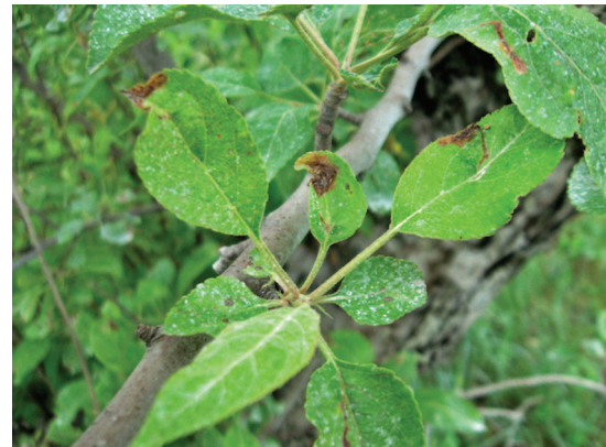
Fig. 6. Apple leaves with larvae or pupae of apple flea weevils. Larval mines originate in the midrib of the leaf, turning brown as the larvae migrates towards the leaf margin to form the pupal blister, also brown (May 24, 2011).

each location 2–3 blocks were sampled, each containing five randomly selected tree rows. Within an orchard row, 10 trees were measured for severity of damage. Severity was categorized as absent, low, medium, and high for the whole tree by visual assessment of five randomly selected terminals. Trees where <20% of leaf area were damaged, with 3–5 feeding holes per leaf were considered low damage intensity. Medium intensity was denoted by 20–60% of leaf area had feeding damage, with leaves having 10 or greater feeding sites. Trees classified as “medium” may have regrowth on some terminals that were undamaged. At heavy damage levels, >60% of leaf area had damage and the leaves were severely damaged (Fig. 5). Location of each tree was recorded with a handheld GPS unit (eTrex Vista HCx, Garmin, Olathe, KS). Coordinates were uploaded into GoogleMaps and severity of damage was color coded (zero: green, low: yellow, medium: magenta, high: red). High leaf feeding damage was evident at all sites sampled in fall 2010 with over 80% of trees sampled falling into the medium or high leaf damage categories (Table 1; Fig. 7). From 2008 to 2010, few apples were on trees in these blocks, with no apples present in 2010 although spring frosts may have exacerbated blossom damage. Fewer than 4% of trees had no visible damage and these trees were primarily in a cultivated block at the Flushing, MI farm.