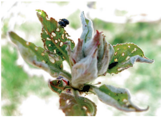
Fig. 3. Leaf feeding damage by spring adults at tight cluster phenological stage of apple (May 5, 2011).