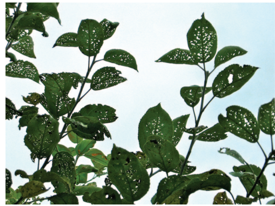
Fig. 5. Heavy leaf damage from apple flea weevil feeding (October 2010).