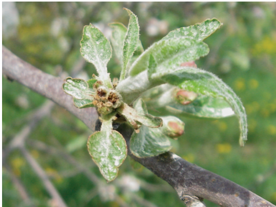
Fig. 4. Apple flea weevil damage to bud cluster. Note that feeding has terminated the flower buds (May 13, 2011).