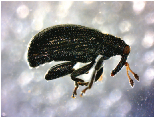
Fig. 1. Adult Orchestes pallicornis (apple flea weevil).