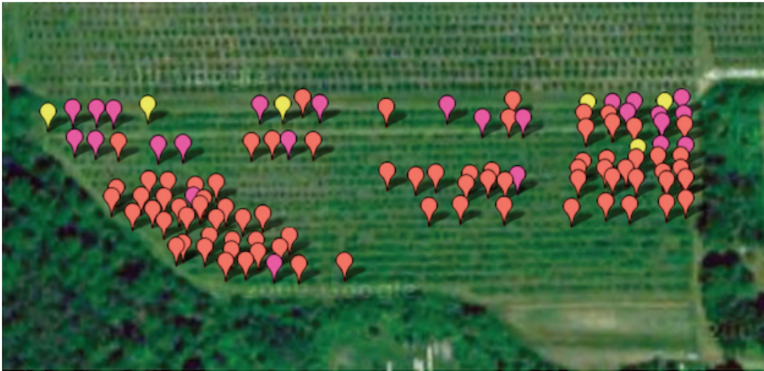
Fig. 7. Incidence of apple flea weevil damage at 2 organic orchards in Michigan. Severity of leaf damage was scored as low (yellow), medium (magenta), and high (red) in the fall.

ate, and pyrethroid insecticides, we know very little about the pest's biology and no control recommendations exist that are suitable by today's standards.